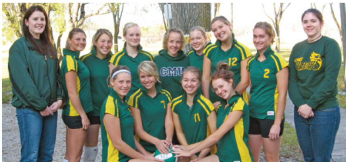
CMU women’s volleyball team: ACCA and CPAC champions.

The next Church in Ministry Seminars is in January, 2010. B