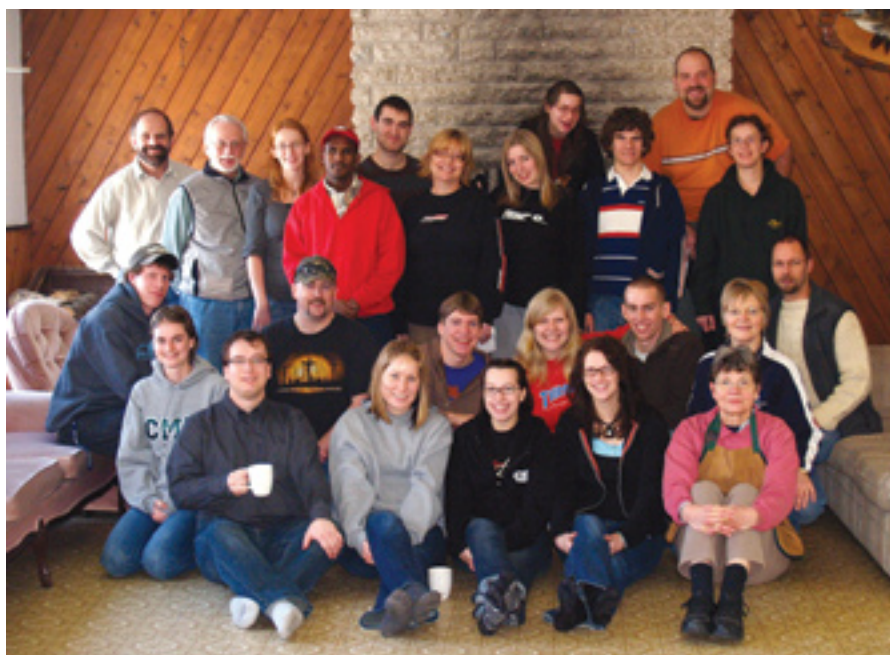
Students, staff and speakers at the Ministry Quest retreat.